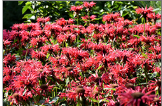
Gardenview Scarlet Beebalm flowers

Gardenview Scarlet Beebalm is recommended for the following landscape applications;