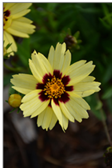
UpTick Cream and Red Tickseed flowers

UpTick Cream and Red Tickseed is recommended for the following landscape applications;