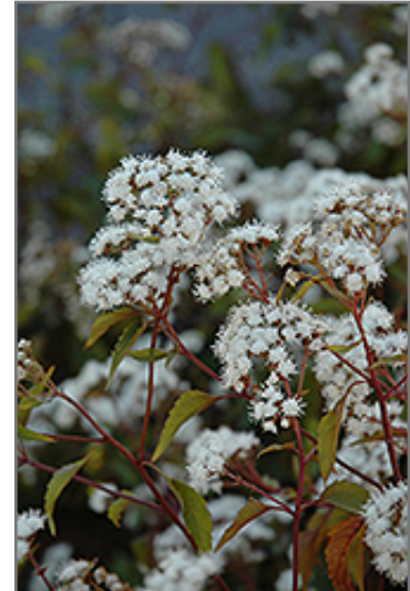
Chocolate Boneset flowers

This is a relatively low maintenance plant, and is best cleaned up in early spring before it resumes active growth for the season. It is a good choice for attracting butterflies to your yard, but is not particularly attractive to deer who tend to leave it alone in favor of tastier treats. It has no significant negative characteristics.