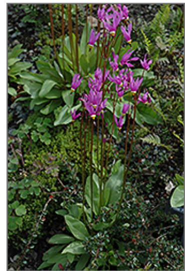
Shooting Star in bloom