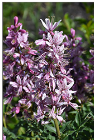
Pink Gas Plant flowers

Pink Gas Plant is recommended for the following landscape applications;