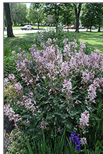
Pink Gas Plant in bloom