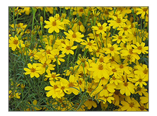
Zagreb Tickseed flowers

This is a relatively low maintenance plant, and is best cleaned up in early spring before it resumes active growth for the season. It is a good choice for attracting butterflies to your yard, but is not particularly attractive to deer who tend to leave it alone in favor of tastier treats. It has no significant negative characteristics.