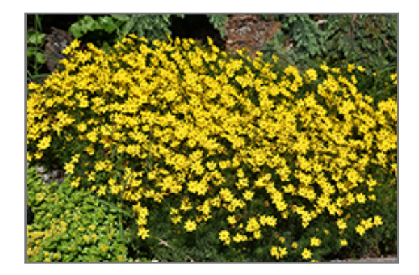
Zagreb Tickseed in bloom

Zagreb Tickseed is an open herbaceous perennial with a mounded form. It brings an extremely fine and delicate texture to the garden composition and should be used to full effect.