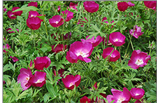
Buffalo Poppy flowers

Buffalo Poppy is recommended for the following landscape applications;