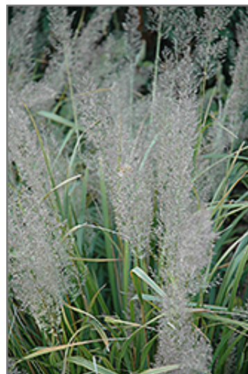
Korean Reed Grass fruit