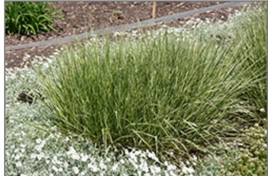
Variegated Reed Grass