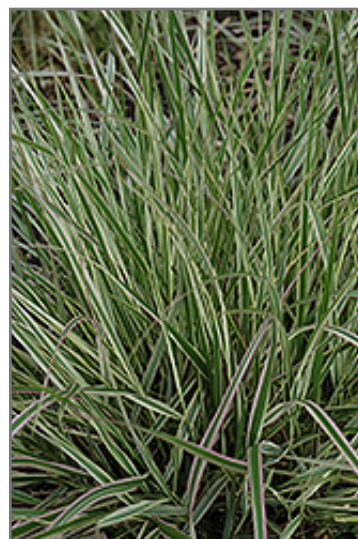
Variegated Reed Grass foliage