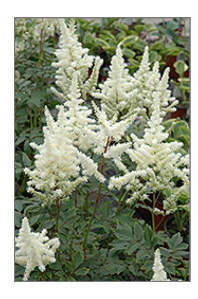
Bridal Veil Astilbe flowers

Bridal Veil Astilbe is an herbaceous perennial with an upright spreading habit of growth. Its relatively fine texture sets it apart from other garden plants with less refined foliage.