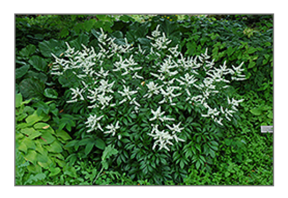
Bridal Veil Astilbe in bloom

This is a relatively low maintenance plant, and is best cleaned up in early spring before it resumes active growth for the season. It is a good choice for attracting butterflies to your yard, but is not particularly attractive to deer who tend to leave it alone in favor of tastier treats. It has no significant negative characteristics.