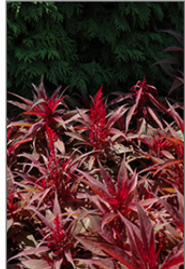
Dragon's Breath Plumed Celosia flowers

Dragon's Breath Plumed Celosia is recommended for the following landscape applications;