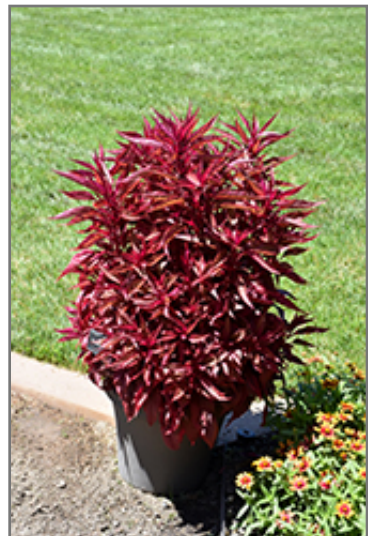
Dragon's Breath Plumed Celosia