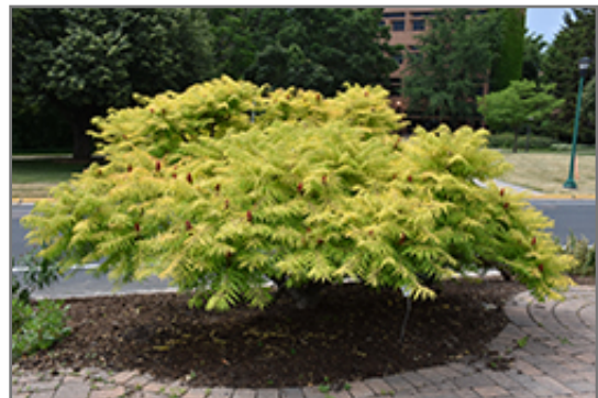
Tiger Eyes Sumac