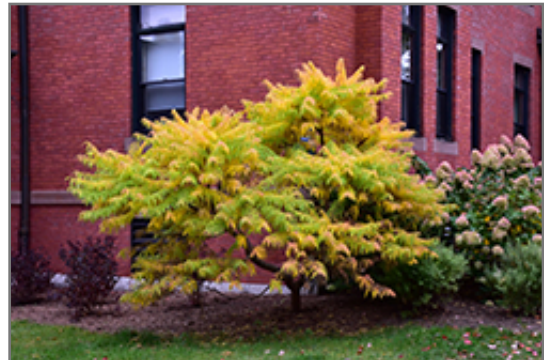
Tiger Eyes Sumac in fall

Tiger Eyes Sumac is recommended for the following landscape applications;