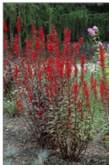
Black Truffle Cardinal Flower in bloom