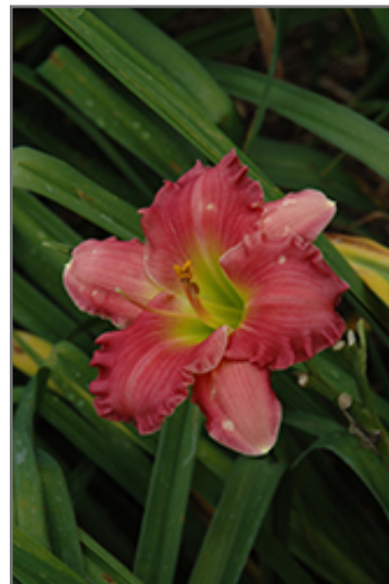
Passionate Returns Daylily flowers