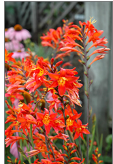
Prince Of Orange Crocosmia flowers

This is a relatively low maintenance plant, and should be cut back in late fall in preparation for winter. It is a good choice for attracting bees, butterflies and hummingbirds to your yard, but is not particularly attractive to deer who tend to leave it alone in favor of tastier treats. It has no significant negative characteristics.