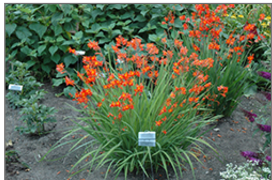
Prince Of Orange Crocosmia in bloom