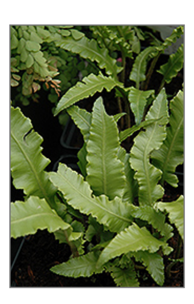
Crested Hart's Tongue Fern foliage

Crested Hart's Tongue Fern is primarily valued in the garden for its cascading habit of growth. Its attractive glossy narrow leaves remain dark green in color throughout the season.