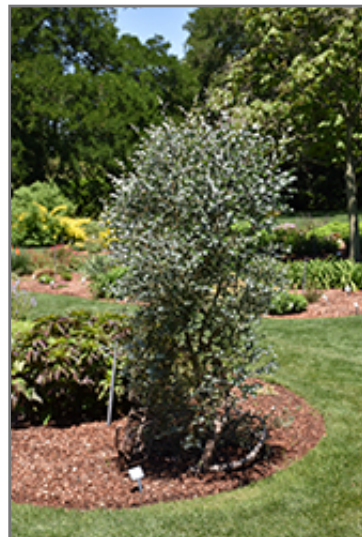
Silver Drop Cider Gum

Silver Drop Cider Gum makes a fine choice for the outdoor landscape, but it is also well-suited for use in outdoor pots and containers. With its upright habit of growth, it is best suited for use as a 'thriller' in the 'spiller-thriller-filler' container combination; plant it near the center of the pot, surrounded by smaller plants and those that spill over the edges. It is even sizeable enough that it can be grown alone in a suitable container. Note that when grown in a container, it may not perform exactly as indicated on the tag - this is to be expected. Also note that when growing plants in outdoor containers and baskets, they may require more frequent waterings than they would in the yard or garden. Be aware that in our climate, this plant may be too tender to survive the winter if left outdoors in a container. Contact our experts for more information on how to protect it over the winter months.