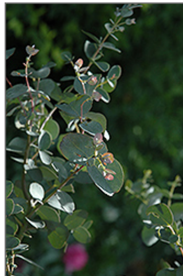
Silver Drop Cider Gum foliage