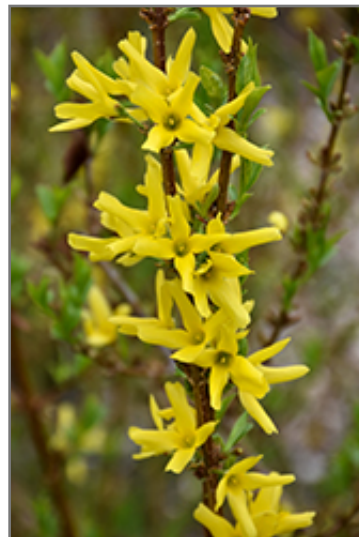
Bronx Forsythia flowers

Bronx Forsythia is recommended for the following landscape applications;