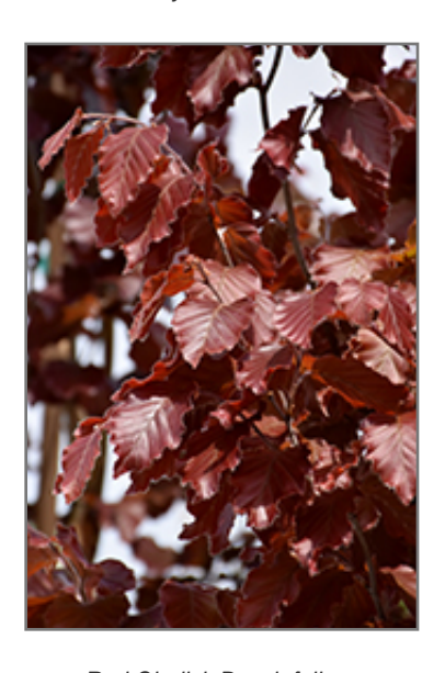
Red Obelisk Beech foliage