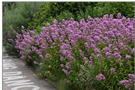
Jeana Garden Phlox in bloom