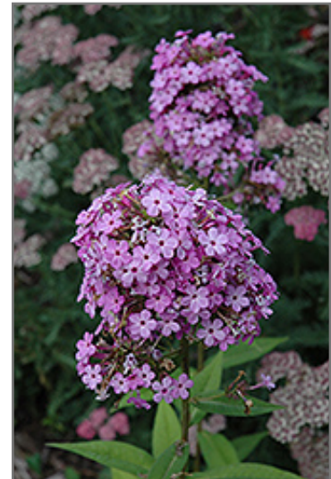
Jeana Garden Phlox flowers