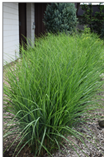
Oktoberfest Maiden Grass