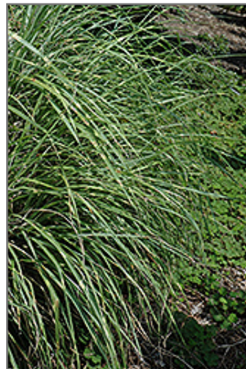
Little Zebra Dwarf Maiden Grass foliage