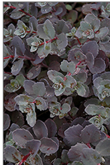
Sunset Cloud Stonecrop foliage

Sunset Cloud Stonecrop is a fine choice for the garden, but it is also a good selection for planting in outdoor pots and containers. Because of its spreading habit of growth, it is ideally suited for use as a 'spiller' in the 'spiller-thriller-filler' container combination; plant it near the edges where it can spill gracefully over the pot. Note that when growing plants in outdoor containers and baskets, they may require more frequent waterings than they would in the yard or garden.