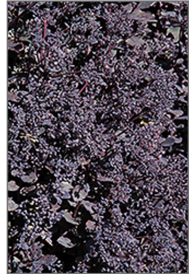
Sunset Cloud Stonecrop flowers

Sunset Cloud Stonecrop is an herbaceous perennial with a ground-hugging habit of growth. Its medium texture blends into the garden, but can always be balanced by a couple of finer or coarser plants for an effective composition.