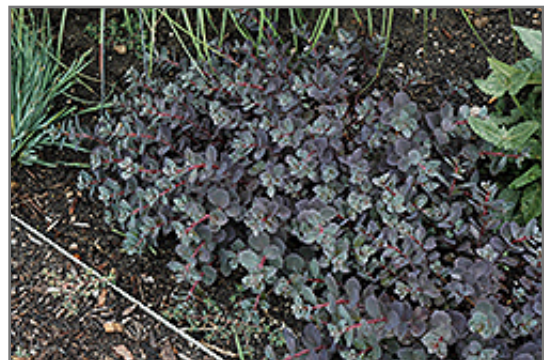
Sunset Cloud Stonecrop