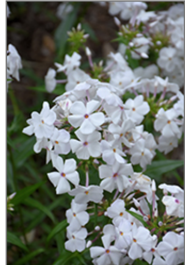
Minnie Pearl Garden Phlox flowers