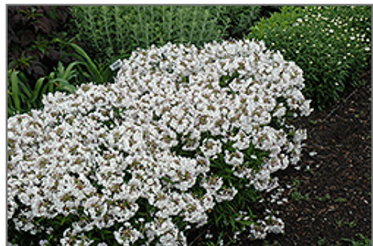
Minnie Pearl Garden Phlox in bloom