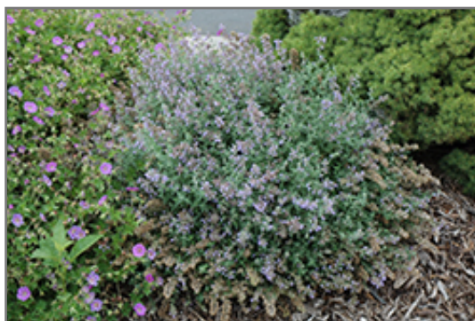
Cat's Meow Catmint in bloom