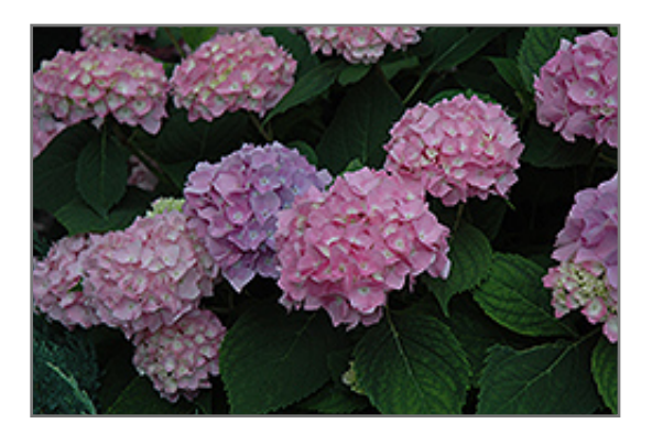
Endless Summer The Original Hydrangea flowers

This shrub will require occasional maintenance and upkeep, and should only be pruned after flowering to avoid removing any of the current season's flowers. It has no significant negative characteristics.