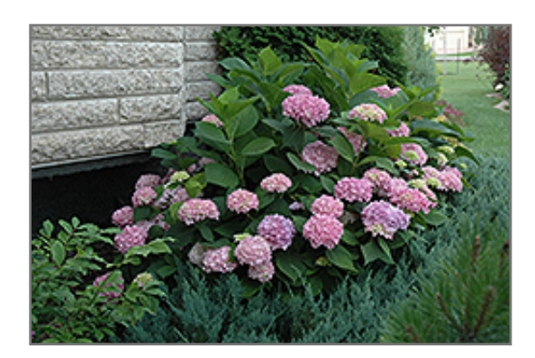
Endless Summer The Original Hydrangea in bloom

Endless Summer The Original Hydrangea will grow to be about 4 feet tall at maturity, with a spread of 4 feet. It tends to fill out right to the ground and therefore doesn't necessarily require facer plants in front. It grows at a fast rate, and under ideal conditions can be expected to live for approximately 20 years.