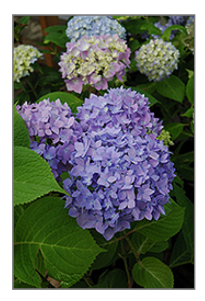
Endless Summer The Original Hydrangea flowers