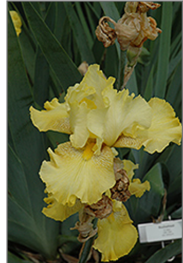
Buckwheat Iris flowers

Buckwheat Iris is recommended for the following landscape applications;