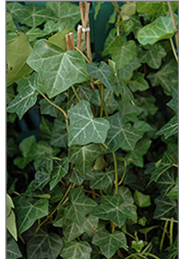
Thorndale Ivy foliage

Thorndale Ivy is recommended for the following landscape applications;