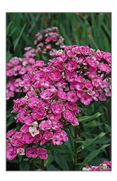
Aureole Garden Phlox flowers

Exceptional early blooms of fragrant fuchsia flowers with chartreuse edges and cream petal reverses, on plants that tend to be bushier; suitable for containers or small perennial borders; good mildew resistance