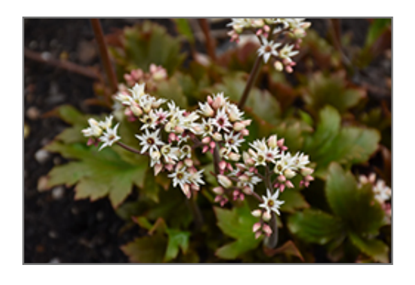
Karasuba Mukdenia flowers