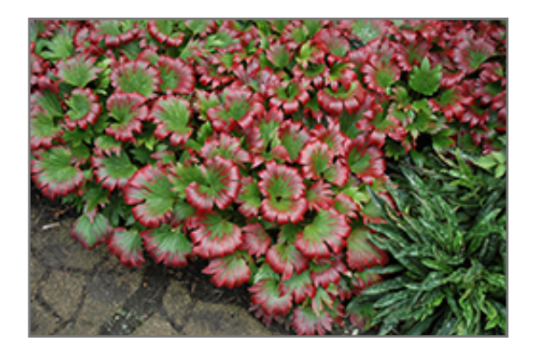
Karasuba Mukdenia

Karasuba Mukdenia features dainty spikes of white bell-shaped flowers rising above the foliage from early to mid spring. Its attractive glossy fan-shaped leaves emerge coppery-bronze in spring, turning dark green in color with prominent crimson tips throughout the season.