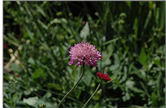
Melton Pastels Scabious flowers