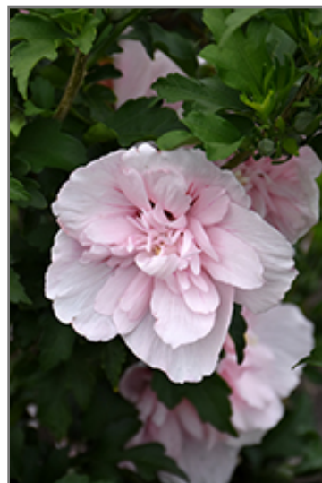
Pink Chiffon Rose of Sharon flowers

Pink Chiffon Rose of Sharon is a multi-stemmed deciduous shrub with an upright spreading habit of growth. Its average texture blends into the landscape, but can be balanced by one or two finer or coarser trees or shrubs for an effective composition.