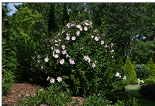
Pink Chiffon Rose of Sharon in bloom