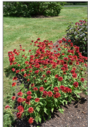
Double Scoop Orangeberry Coneflower in bloom