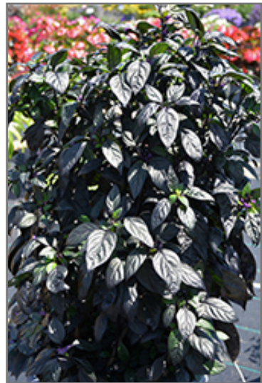
Black Pearl Ornamental Pepper