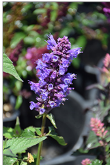
Blue Boa Hyssop flowers

Blue Boa Hyssop is a fine choice for the garden, but it is also a good selection for planting in outdoor pots and containers. With its upright habit of growth, it is best suited for use as a 'thriller' in the 'spiller-thriller-filler' container combination; plant it near the center of the pot, surrounded by smaller plants and those that spill over the edges. Note that when growing plants in outdoor containers and baskets, they may require more frequent waterings than they would in the yard or garden.