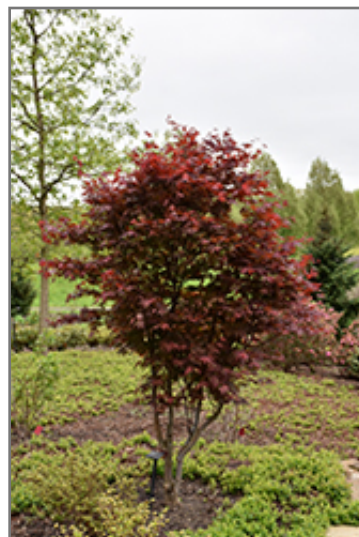
Emperor I Japanese Maple