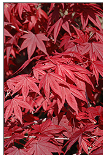
Emperor I Japanese Maple foliage