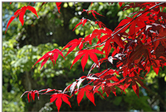
Emperor I Japanese Maple foliage

This tree does best in full sun to partial shade. You may want to keep it away from hot, dry locations that receive direct afternoon sun or which get reflected sunlight, such as against the south side of a white wall. It prefers to grow in average to moist conditions, and shouldn't be allowed to dry out. It is not particular as to soil pH, but grows best in rich soils. It is somewhat tolerant of urban pollution, and will benefit from being planted in a relatively sheltered location. Consider applying a thick mulch around the root zone in winter to protect it in exposed locations or colder microclimates. This is a selected variety of a species not originally from North America.