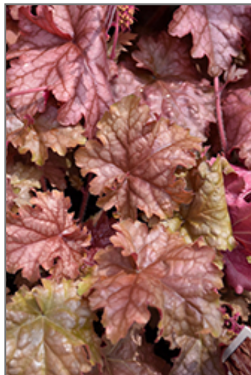
Carnival Peach Parfait Coral Bells foliage

Carnival Peach Parfait Coral Bells is recommended for the following landscape applications;