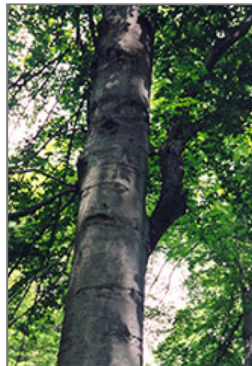
American Beech bark

This tree should only be grown in full sunlight. It requires an evenly moist well-drained soil for optimal growth, but will die in standing water. It is not particular as to soil pH, but grows best in rich soils. It is quite intolerant of urban pollution, therefore inner city or urban streetside plantings are best avoided, and will benefit from being planted in a relatively sheltered location. This species is native to parts of North America.