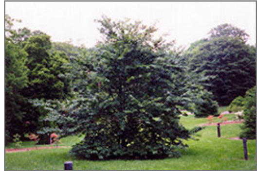
American Beech