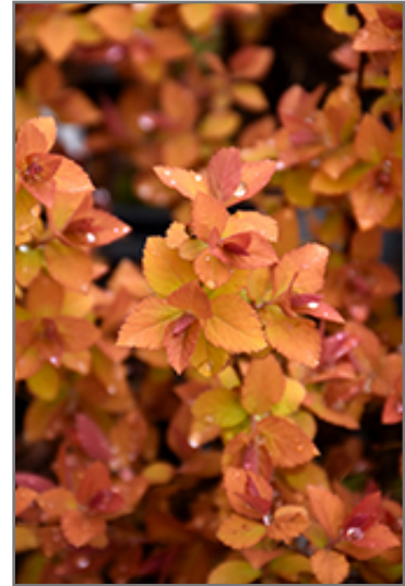
Double Play Big Bang Spirea foliage

This shrub should only be grown in full sunlight. It prefers to grow in average to moist conditions, and shouldn't be allowed to dry out. It is not particular as to soil type or pH. It is highly tolerant of urban pollution and will even thrive in inner city environments. This particular variety is an interspecific hybrid.