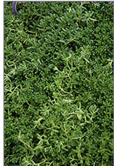
Baby Tears Stonecrop foliage

Baby Tears Stonecrop is recommended for the following landscape applications;