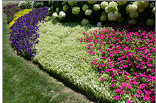
Frosty Knight Alyssum in bloom

Frosty Knight Alyssum is a fine choice for the garden, but it is also a good selection for planting in hanging baskets. Because of its trailing habit of growth, it is ideally suited for use as a 'spiller' in the 'spiller-thriller-filler' container combination; plant it near the edges where it can spill gracefully over the pot. Note that when growing plants in outdoor containers and baskets, they may require more frequent waterings than they would in the yard or garden.