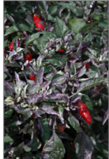
Calico Ornamental Pepper fruit