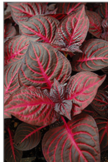
Blazin' Rose Blood Leaf foliage