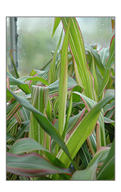
Field Of Dreams Ornamental Corn foliage

Field Of Dreams Ornamental Corn will grow to be about 5 feet tall at maturity, with a spread of 24 inches. When grown in masses or used as a bedding plant, individual plants should be spaced approximately 18 inches apart. It tends to be leggy, with a typical clearance of 2 feet from the ground, and should be underplanted with lower-growing perennials. This fast-growing annual will normally live for one full growing season, needing replacement the following year.