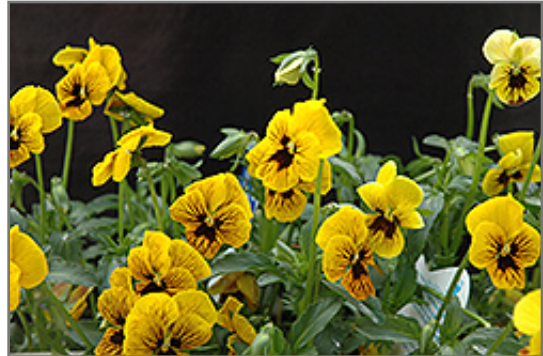
Angel Tiger Eye Pansy flowers