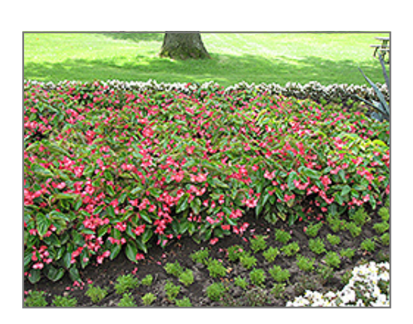
Dragon Wing Pink Begonia in bloom

Dragon Wing Pink Begonia is a fine choice for the garden, but it is also a good selection for planting in outdoor containers and hanging baskets. It is often used as a 'filler' in the 'spiller-thriller-filler' container combination, providing a mass of flowers and foliage against which the thriller plants stand out. Note that when growing plants in outdoor containers and baskets, they may require more frequent waterings than they would in the yard or garden.