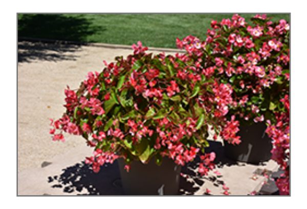
Dragon Wing Pink Begonia flowers