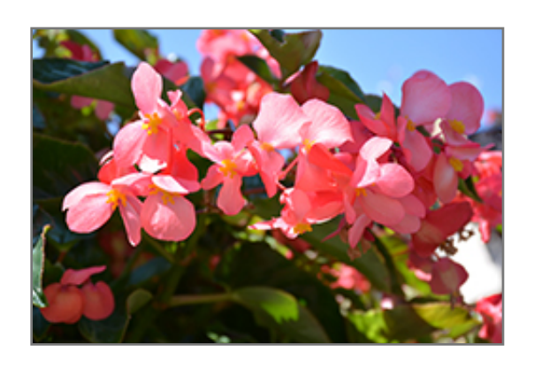
Dragon Wing Pink Begonia flowers

Dragon Wing Pink Begonia is an herbaceous annual with a mounded form. Its medium texture blends into the garden, but can always be balanced by a couple of finer or coarser plants for an effective composition.