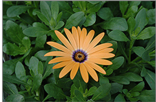
Orange Symphony African Daisy flowers