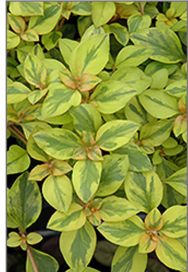
Walkabout Sunset Loosestrife foliage

Walkabout Sunset Loosestrife is recommended for the following landscape applications;