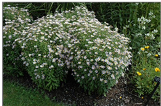
Blue Star Japanese Aster in bloom