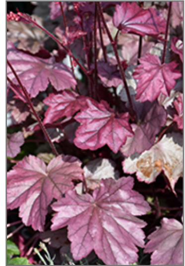
Stainless Steel Coral Bells foliage

Stainless Steel Coral Bells is recommended for the following landscape applications;